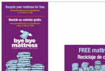
Direct Mail Postcards