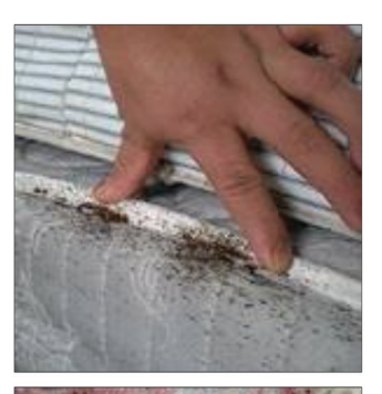
Bed bugs are tan to brown in color, but may appear redder if they have fed.

Signs of bed bug activity may be more obvious than the insects themselves. Look for clusters of dark spots or smudges on mattresses (fecal spots), especially along seams. Eggs, shed skins and all life stages of bed bugs may also be present in these 'soiled' areas.